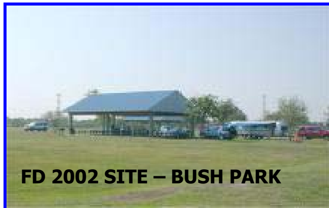
FD 2002 SITE – BUSH PARK