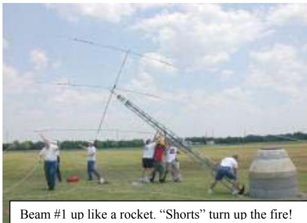
Beam #1 up like a rocket. "Shorts" turn up the fire!

With a 30 wpm burst of Morse code spelling the word "Go", the "Shorts", as they call themselves, are first on tower constructing with a record 7 minutes. One of the team's members told me "With our speed on constructing towers, we can put things up in a hurry". I overheard him later saying that if I thought that was fast wait till it comes down!