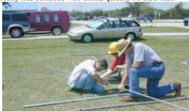
Orders are squealed to each other as Beam #2 takes shape!

The "Heterodynes" or "Squealers", as they are know around the world, took a different approach this time by putting the antenna together first. The head "Squeak" told me that they have tried many different ways of doing this over the last 15 years and they have decided that this is the best way. In talking with him after the contest was over he told me that if the tower doesn't get built, they could just lean the antenna on a tree and use it that way. I really like someone who thinks quickly on their feet!