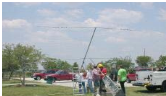
In the highest shriek ever, the Squeaks put up Beam #2

Constructing towers and beams in the shortest time limit using only hand tools has hands, feet and people moving so fast it is hard to tell who is doing what and where.