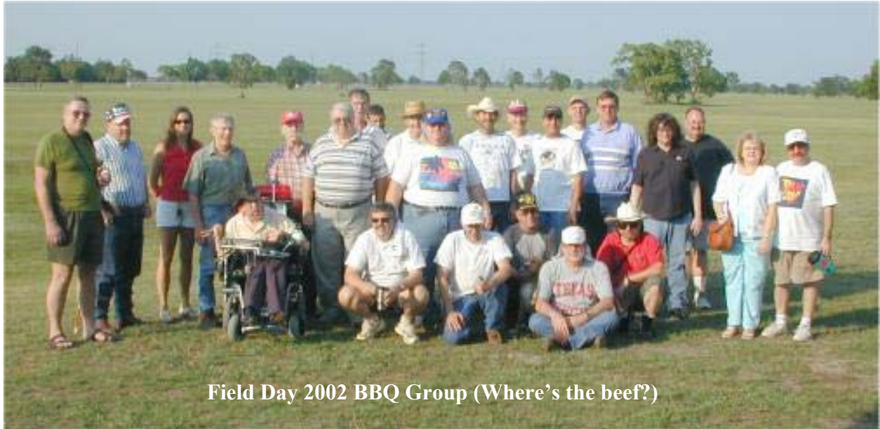
Field Day 2002 BBQ Group (Where's the beef?)

The 2002 Field Day is over. I know everybody is hoping we did well in the number of contacts. A lot of hard work went into preparing for this year's field day and I really appreciate everything that everyone did. Field Day brings the club together for a good time, hopefully good food and a purpose for Amateur Radio. Events over the past year have people talking about Amateur Radio and what it can do. It has been proven again that amateur radio is a reliable resource in times of emergencies and disasters. As amateur radio operators, we need to be available and ready for those situations.