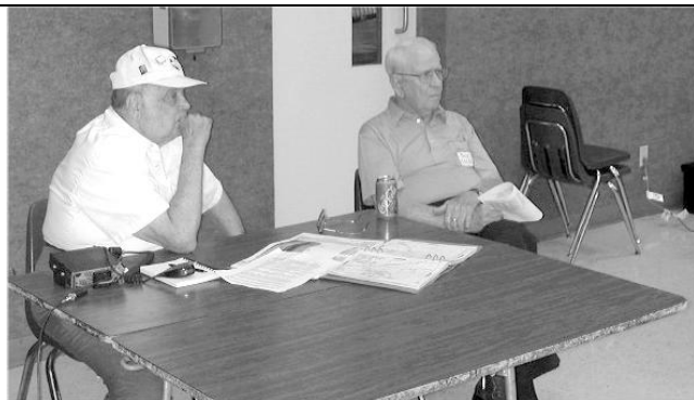
KK5UO and K5CEK contemplating

800 471 7373 281 355 7373 FAX 281 355 8007