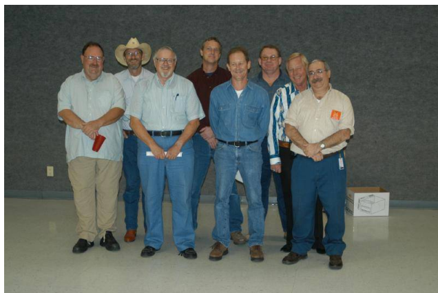
Some of the 2005 officers and directors.