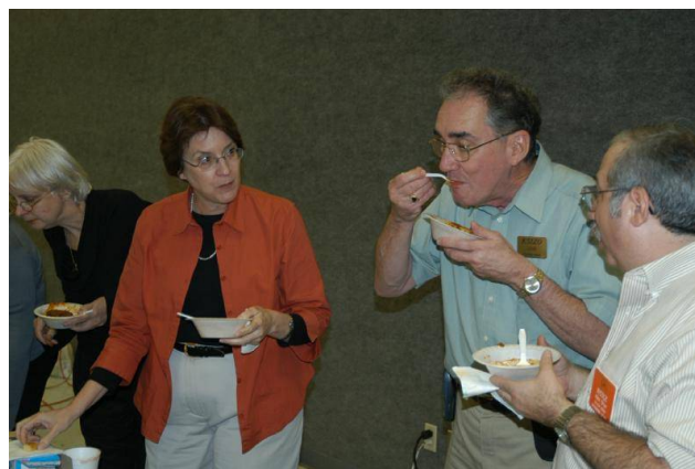
More from the scene.