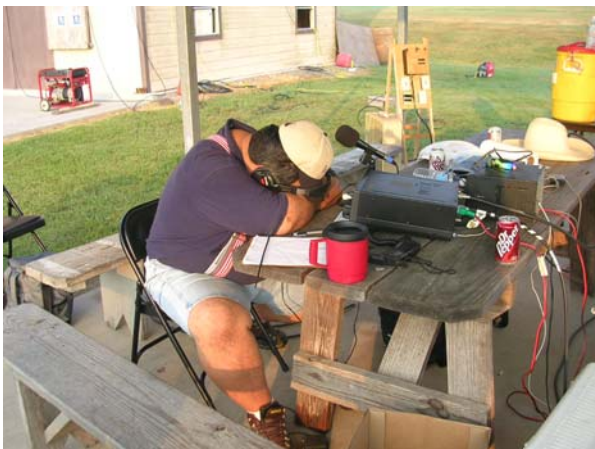
Early morning 6M operations - after an all nighter

BVARC probably didn't do so well in the score department primarily because of 2 reasons – a) our perennial CW high scorer was overseas and 2) the operators were more focused on being sure that everyone understood what was going on and shared their station generously (i.e. fun prevailed over competitiveness).