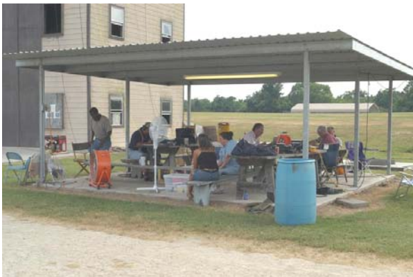
Pavillion operating site

Many people brought friends and family. The Fort Bend County Sheriff visited as well as several representatives from agencies such as the Red Cross. Several people got to see amateur radio for the first time and others got to share in operating on bands that they are not licensed for (such as HF) while others acted as the control operator.