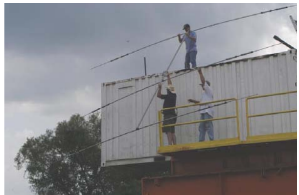
Up with a beam