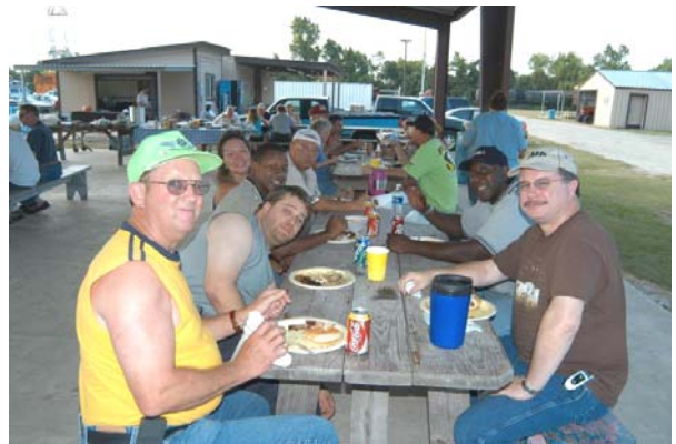
Soup is on

BVARC probably didn't do so well in the score department primarily because of 2 reasons – a) our perennial CW high scorer was overseas and 2) the operators were more focused on being sure that everyone understood what was going on and shared their station generously (i.e. fun prevailed over competitiveness).