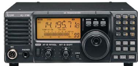
Icom IC-718 All band HF Transceiver

We are renting additional tables in anticipation of a much larger number of sellers and attendees. See the flyer in this newsletter or www.houstonhamfest.org for complete details.