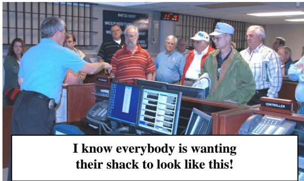
I know everybody is wanting their shack to look like this!

February Meeting Big Success! The BVARC road trip in February was a great success with over 30 members attending the program at the Fort Bend County EMROG building in Richmond. We want to thank Fort Bend County for letting the program and the excellent tour!