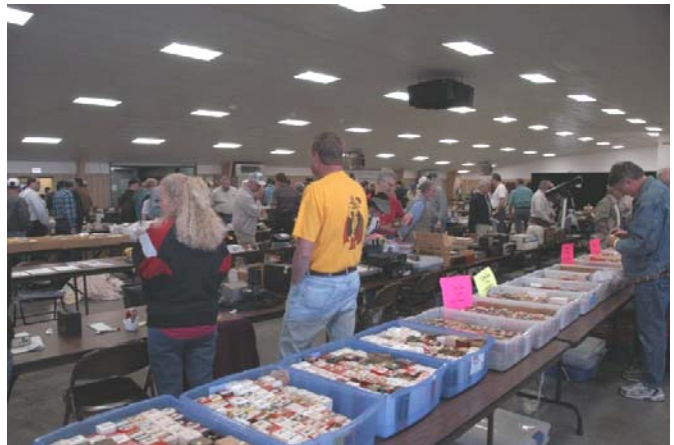
Another of the crowd in the other direction