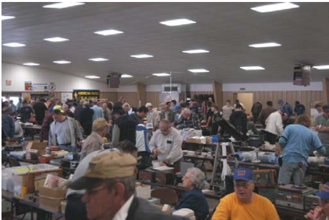
Part of the crowd.