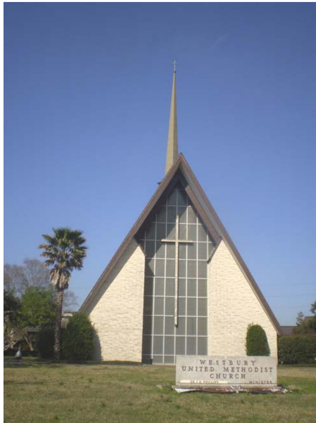
The Birthplace of BVARC – Westbury United Methodist Church

This organizational meeting was held at the Westbury United Methodist Church on Friday, September 16, 1977. The church happens to be located in my neighborhood several blocks from my house, and when I pass by the church I often think of the founding of BVARC.