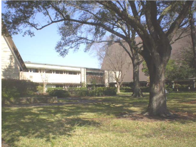
The organizational meeting of BVARC was likely held in this wing of the Westbury United Methodist Church