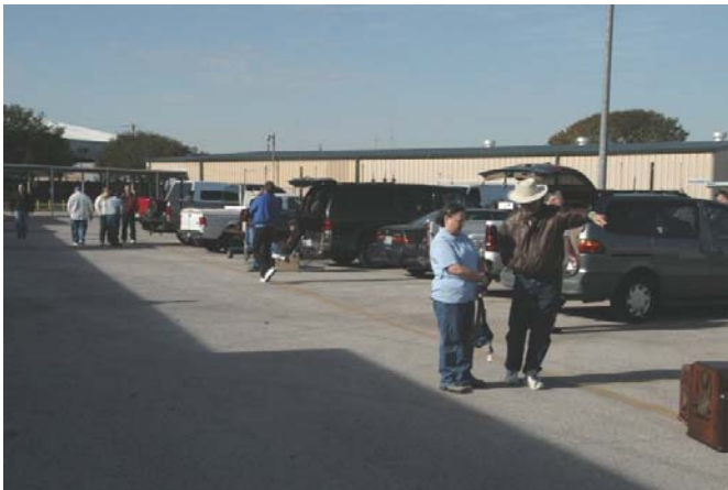
Just a few of the tailgaters