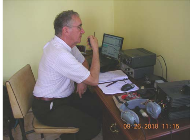
K5IZO/P near Jasper, TX

BVARC participation is clearly increasing and further individual member participation is encouraged. Keep the Texas QSO Party in mind for next year. Everyone who participates always says how much fun they had.