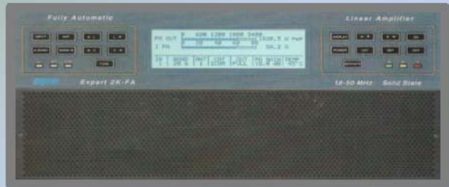
SPE EXPERT 2K-FA