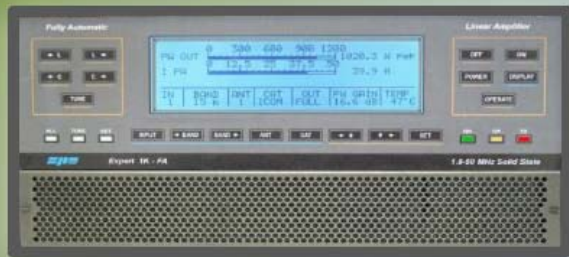
SPE EXPERT 1K-FA