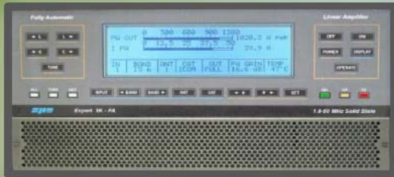
SPE EXPERT 1K-FA