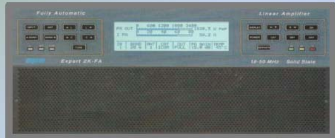
SPE EXPERT 2K-FA