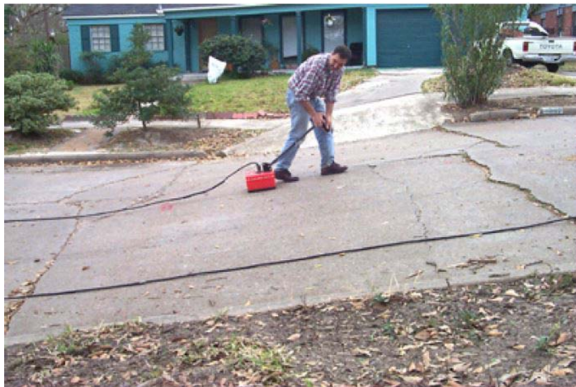
Figure 69 – GPR Profile 6: Long Point Fault (Survey in Progress. Looking North.)

During Project Beacon the NDB located near the Long Point Fault in the Addicks area of west Houston showed the greatest frequency shift. The photograph below from the recently published report on faulting and subsidence in Houston shows an engineer using ground penetrating radar (GPR) to measure the displacement on the Long Point Fault.