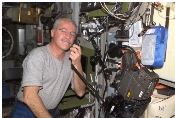
Ham Radio at the ISS – And you thought your shack was disorganized!