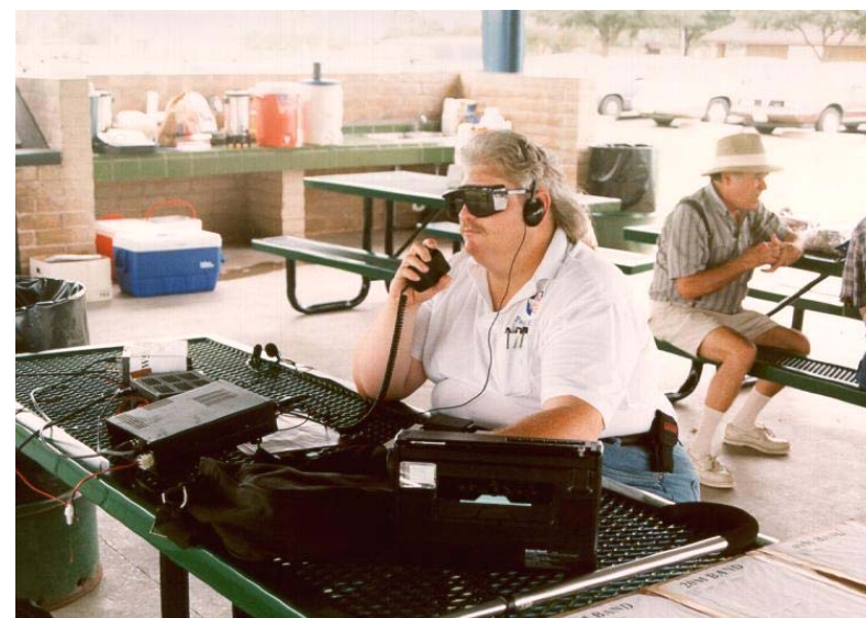
Field Day: N0JAA and KK5W