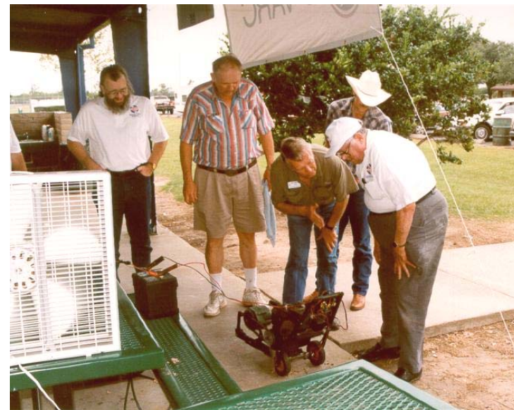
Field day: WB5IIB, N5VXU, KC5EEU, and KK5UO