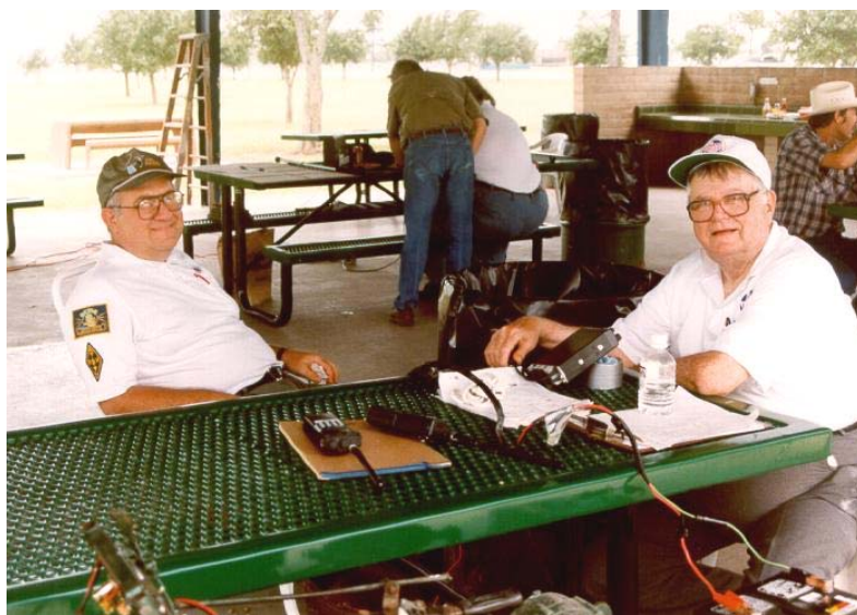
Field Day: AK5G and KK5UO