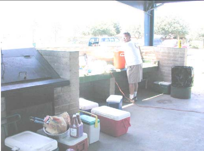
Some scenes from Dayton