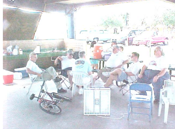
Chewing the fat