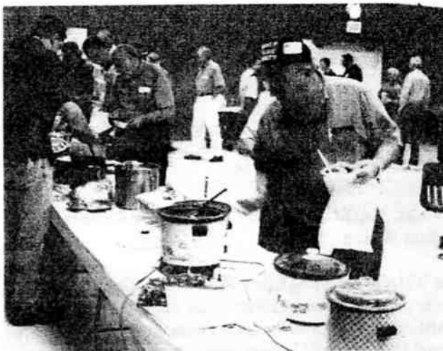
Chili Supper Pics