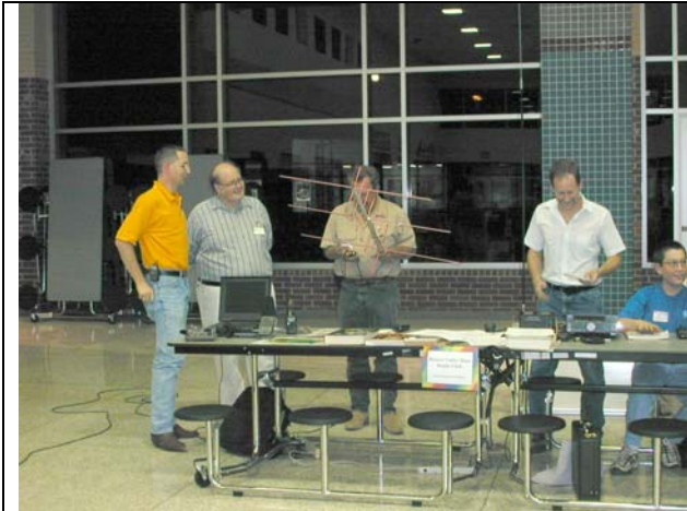
Helping out at the PACE event