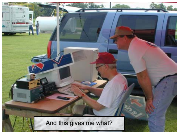
And this gives me what?