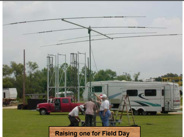
Raising one for Field Day