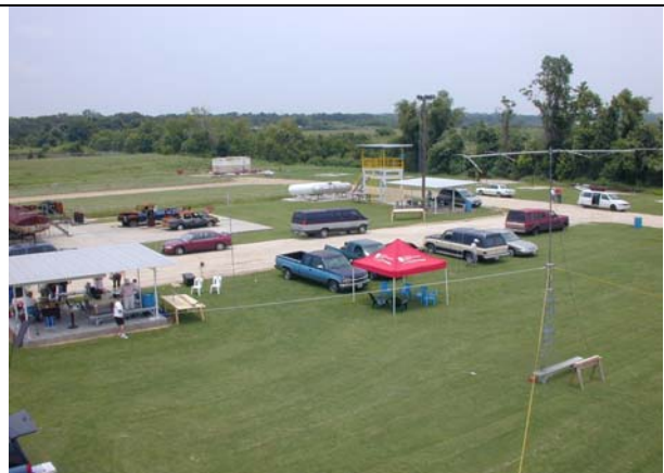
Plenty of room for antennae