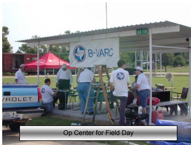
Op Center for Field Day