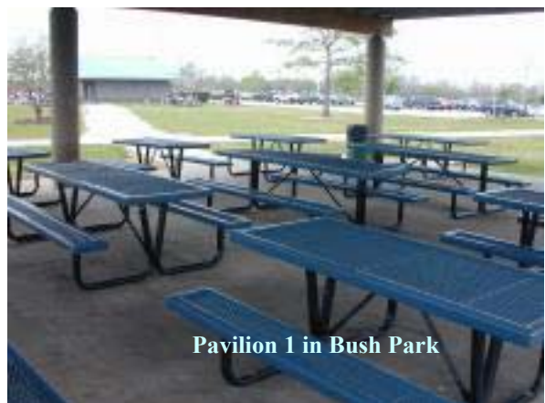
Pavilion 1 in Bush Park