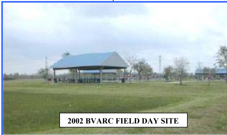
2002 BVARC FIELD DAY SITE