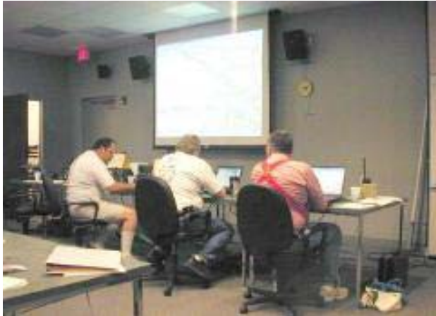
Projection screen of Medical Units via APRS

The MS150 Command Post was manned by Tidelands Amateur Radio Club as well as several other amateurs from the Houston area. It a 24 hour "round the clock" effort for support for the bike ride. The command post works with all the 911 services on the bike route helping with medical dispatches that originate from riders on their cell phones.