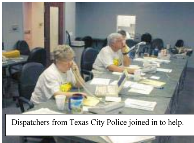
Dispatchers from Texas City Police joined in to help.

I wanted to take this home but somebody said no!