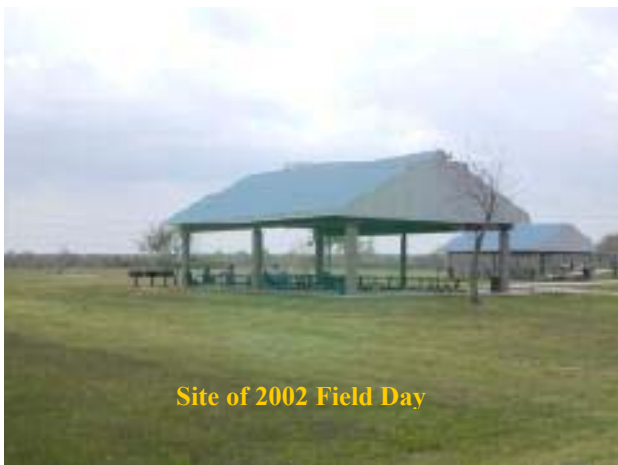
Site of 2002 Field Day