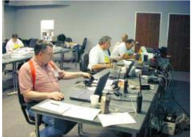
HF, VHF, and UHF was used for communications