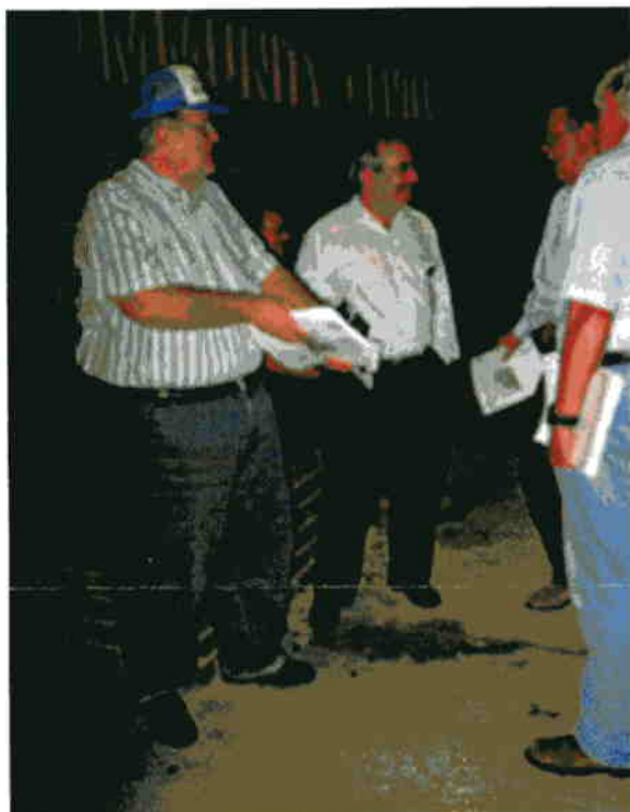
BVARC members chatting outside the Community Center