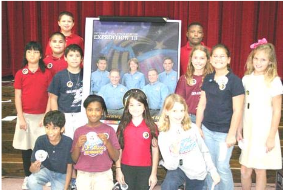
Twelve Austin Elementary students spoke to an actual NASA astronaut as she orbited space.

Note: This is a Copyrighted article, Copyright © 2009 Fort Bend Herald, December 10, 2008