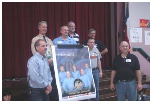
Note: These last 2 pictures are not from the copyrighted article and were downloaded from the BVARC website.