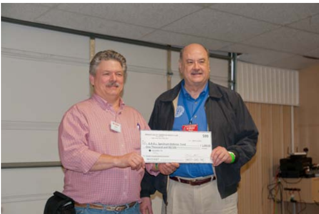
Presentation of $1000 check to ARRL for Spectrum Defense Fund

There were several new problems which have already been addressed. We have repeatedly asked attendees and non-attendees to give us feedback so we can continue to improve the Hamfest each year. We even had an on-line survey and received 122 submissions. ALL of these have already been reviewed and are being considered in the upcoming weeks while they are fresh on everyone's mind. Because of the sellout, we are already looking at ways to accommodate more sellers without crowding, possibly a change of venue and even a change in date. All this will be resolved within a few weeks so everyone can mark down the details on their calendar for 2013.