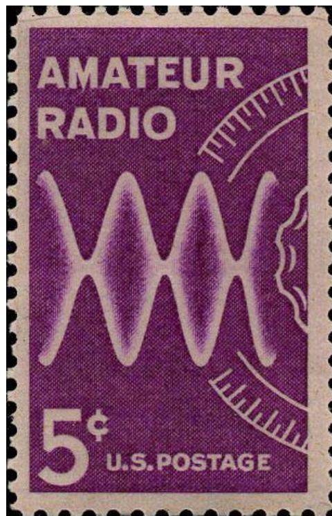
Amateur Radio First Class Postage Stamp issued Dec 15, 1964