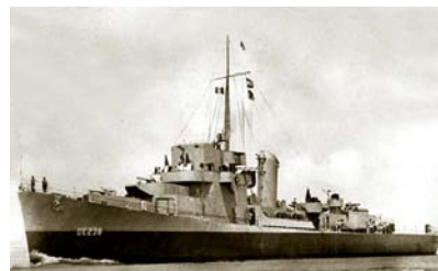
USS Stewart DE-238