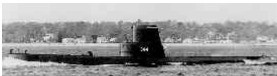
USS Cavalla SS-244