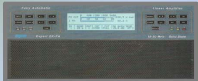
SPE EXPERT 2K-FA