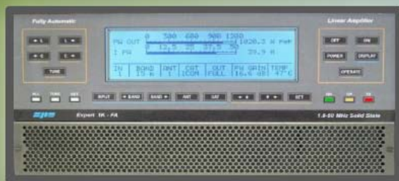
SPE EXPERT 1K-FA