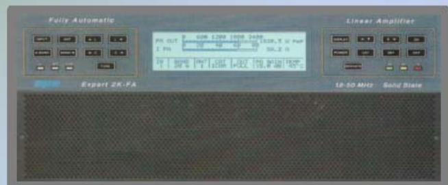
SPE EXPERT 2K-FA