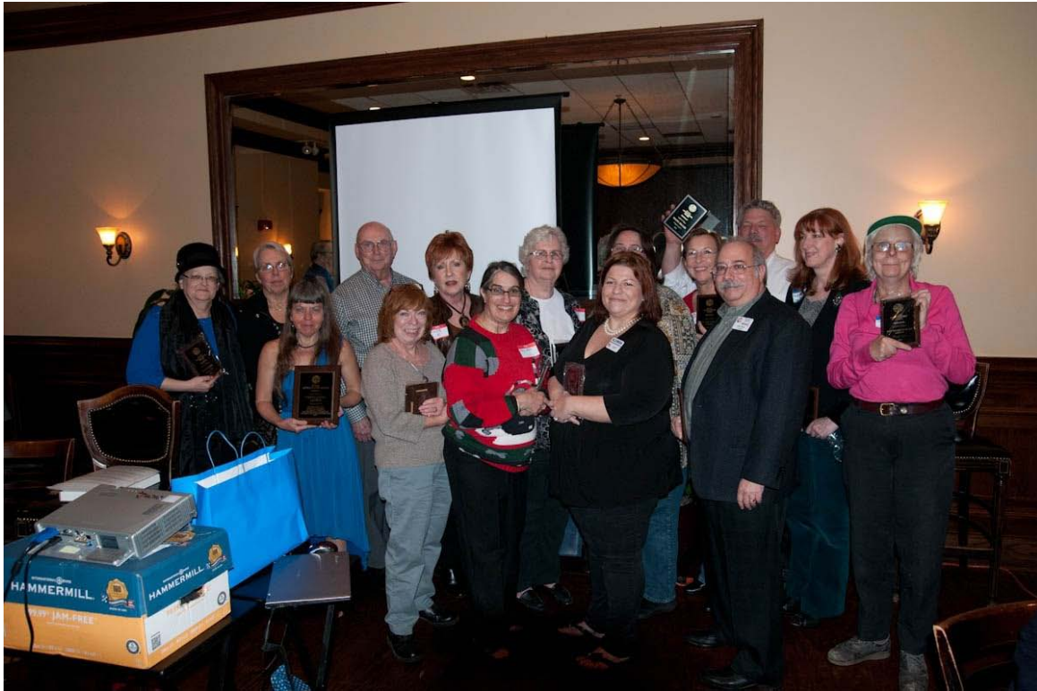
BVARC Service Award Winners